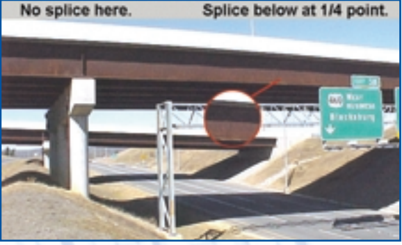
Figure 2. A two-span highway bridge is shown. Note, though difficult to see in the photo, the splice in the steel beam is placed to the left of the Blacksburg sign, and not at the center concrete pier support. The dark line above concrete support is not a splice, but rather a web stiffener. Engineers splice their multi-span beams near the 1/4-points of spans where the bending stress is low. By analogy, it is logical to butt underlayment near the 1/4-points of the sheathing span between the floor joists.

Underlayment end joints should be placed as far away from subfloor end joints as possible. The end joint butt positioning is depicted in Figure 3.