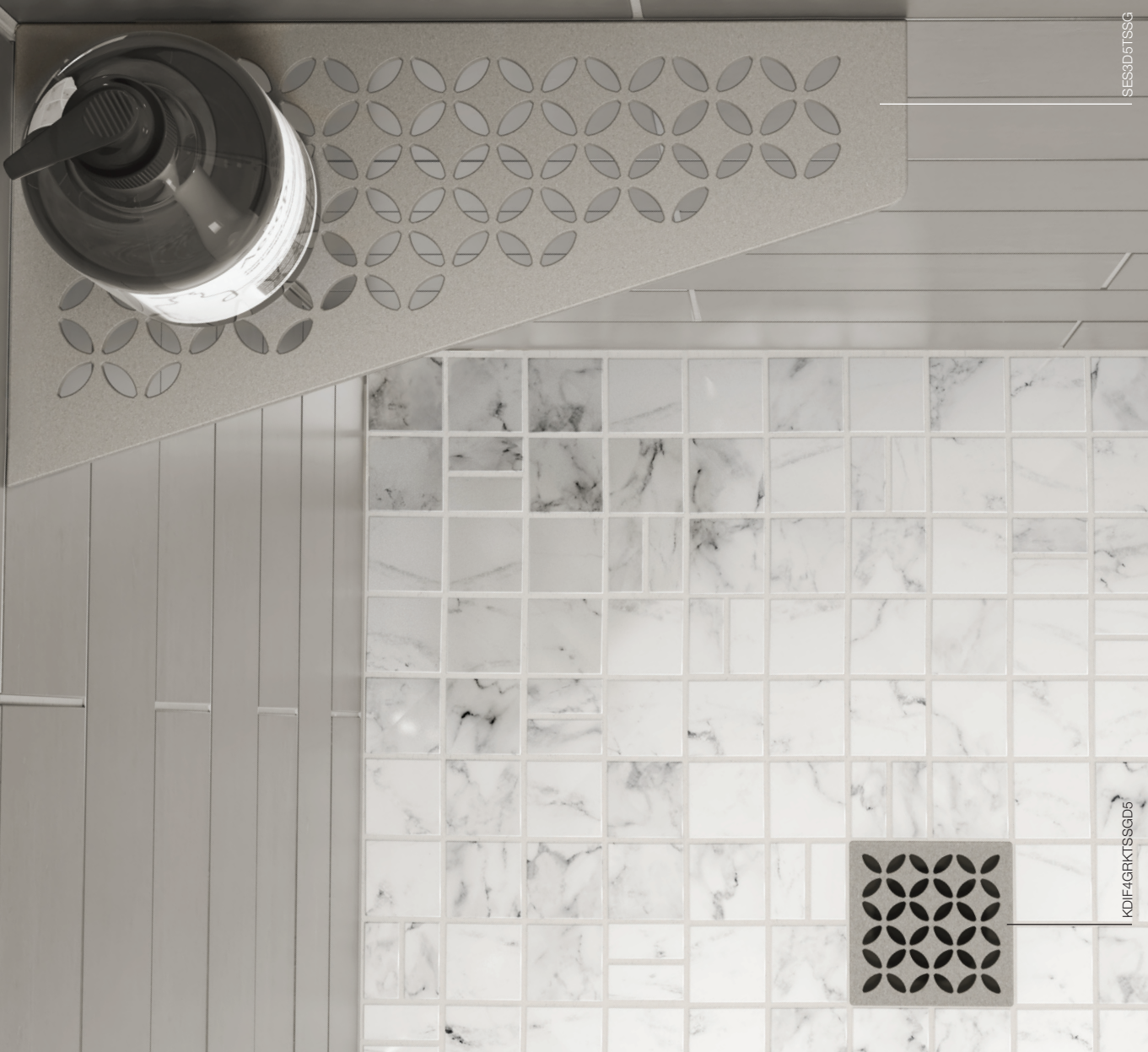
Schluter®- SHELF-E Quadrilateral Corner Shelf