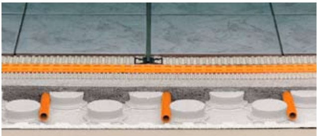
The studs on the modular screed panel limit curing stresses and form a grid pattern to hold the hydronic heating tubes.

Heat pumps operate at highest efficiency when water temperatures are kept relatively low. Therefore, to maximize energy efficiency in such a heating and cooling system, it is essential to optimize delivery of the energy to the space. This was accomplished through a simple and elegant solution.