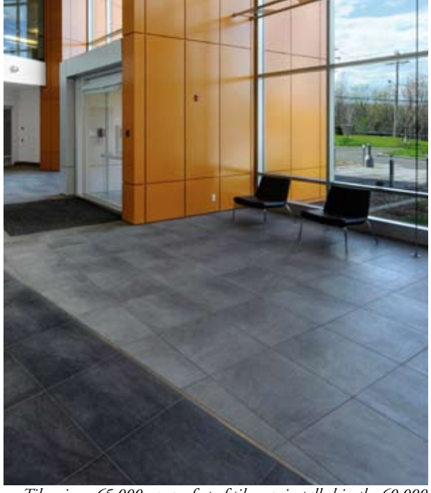
Tile reigns: 65,000 square feet of tile was installed in the 60,000 square foot building.

sistent with green building practices. Efficiency of the heating and cooling system is dependent upon the low thermal resistance of the tile covering in combination with the modular screed assembly. Ceramic tile produces no VOC emissions, does not harbor dust, and is easy to clean, thus contributing to overall indoor air quality. Thanks in part to the energy efficiency achieved and various other compracmonsense green tices, Schlüter Systems expects the new facility will receive LEED® Gold Certification.