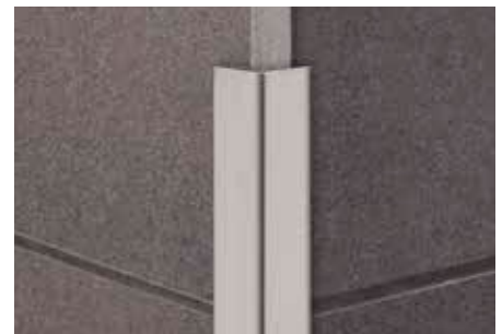
Schlüter-ECK-K 15 EB